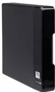
OXO Connect C25